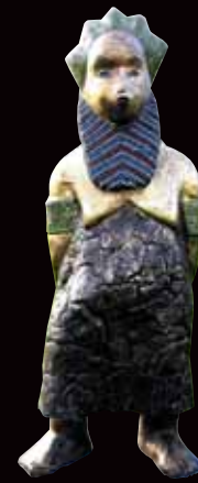
Naomie THE AFRICAN Sponsor : The city of Paris Installation in Ouagadougou, Burkina Faso in February 2007.