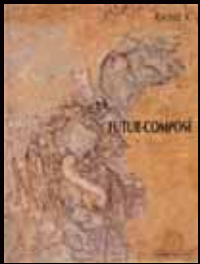
Rachid Khimoune, Futur Composé Chartres 1991