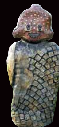
Dick THE ENGLISH MAN Installation planned in London.