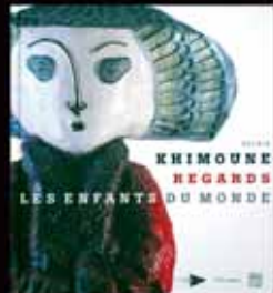
Rachid Khimoune, Regards, Les Enfants du Monde 2001 120 pages. Format : 26 x 29 cm. Editions : Paris Musées, Somogy.