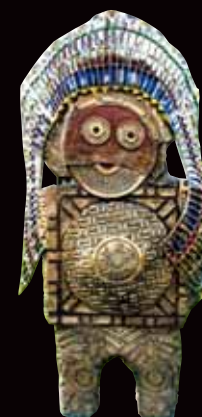
Jim THE NEW YORKER Installation planned in New York.