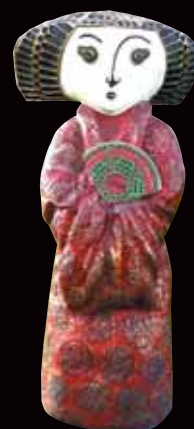
Ayako THE JAPANESE GIRL Installation planned in Tokyo.