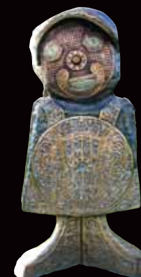
Le Titu Parisien THE PARISIAN KID Sponsor : The city of Andorra Installation in Andorra, June 2006.