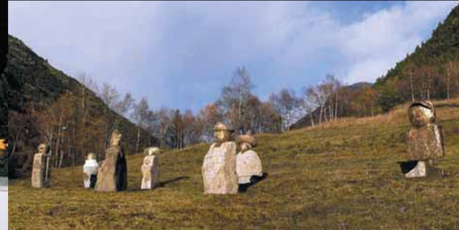
Installation in Ordino, in the Principality of Andorra, of a group entitled "The Jordino Family", with the Parisian Kid.