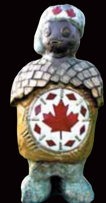
Akarak THE CANADIAN Installation planned in Montreal.