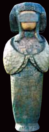
Isis THE EGYPTIAN GIRL Installation planned in Cairo.