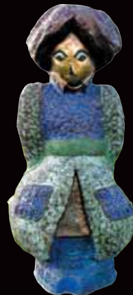
Mahaima THE INDIAN Installation planned in New Delhi.